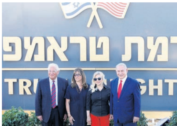
In this June 16, 2019, file photo, Israeli Prime Minister Benjamin Netanyahu, right, his wife Sara, United States Ambassador to Israel David Friedman, left, and his wife Tammy pose during the inauguration of a new settlement named after President Donald Trump in the Golan Heights.

Israel captured the Golan Heights from Syria in the 1967 Mideast war and annexed it in 1981. Most of the international community considers the move, and Israeli settlements in the